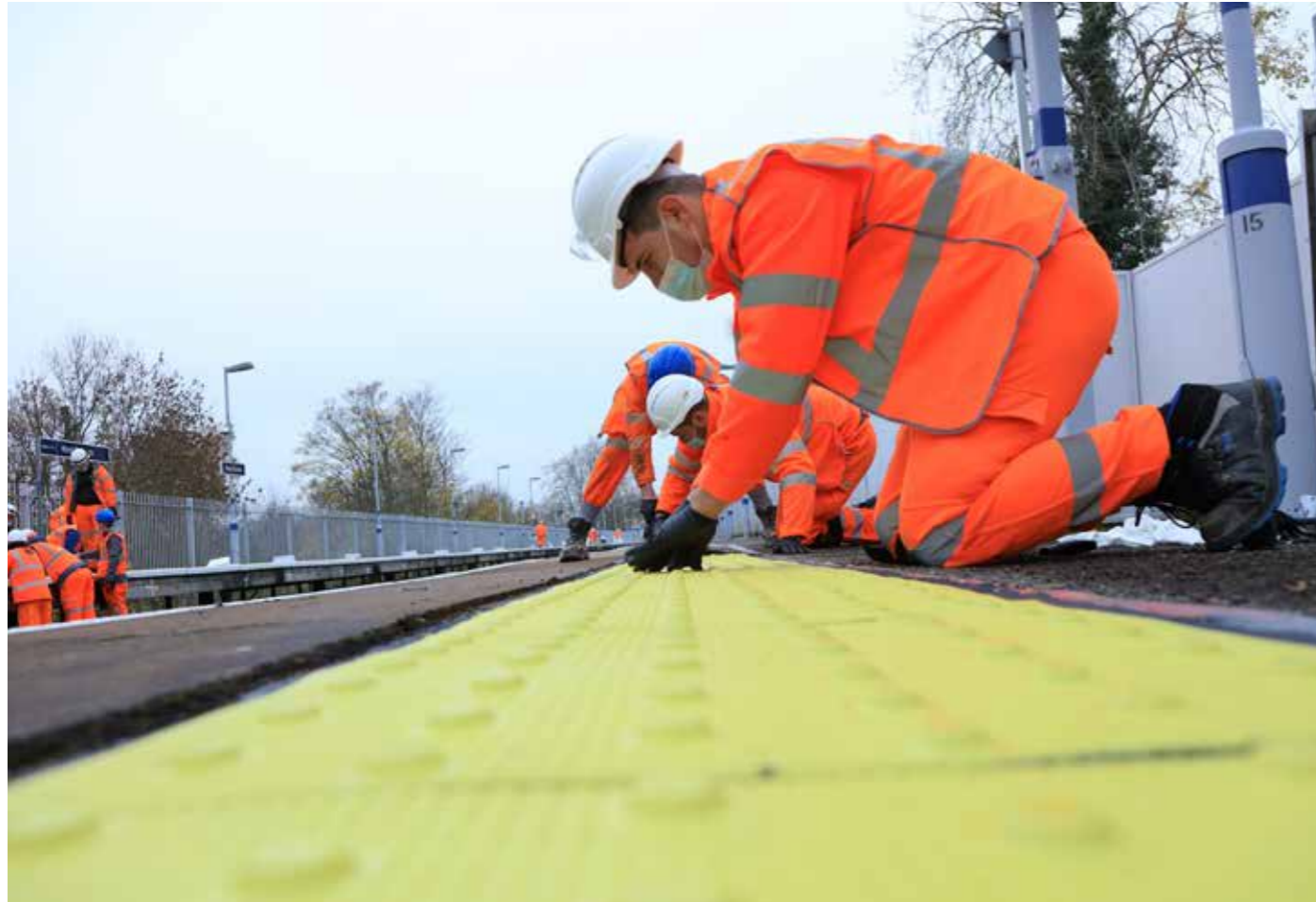
DDA Surface Mounted Tactile Paving - Visul Systems.

USL Speciality Products manufacturer and supply specialist construction products to support, preserve and enhance critical Infrastructure assets, specifically in the Bridge, Rail, Utilities, Offshore, Power and General Construction market spaces. Our products are supplied to fully trained specialist contractors who deliver complex infrastructure projects to strict quality, budget and time constraints.